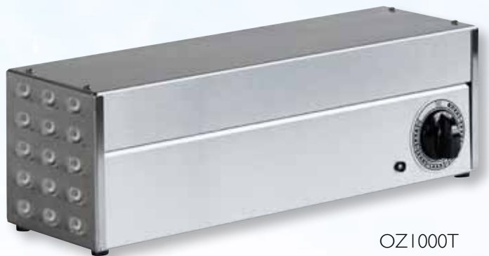
OZ1000T With timer