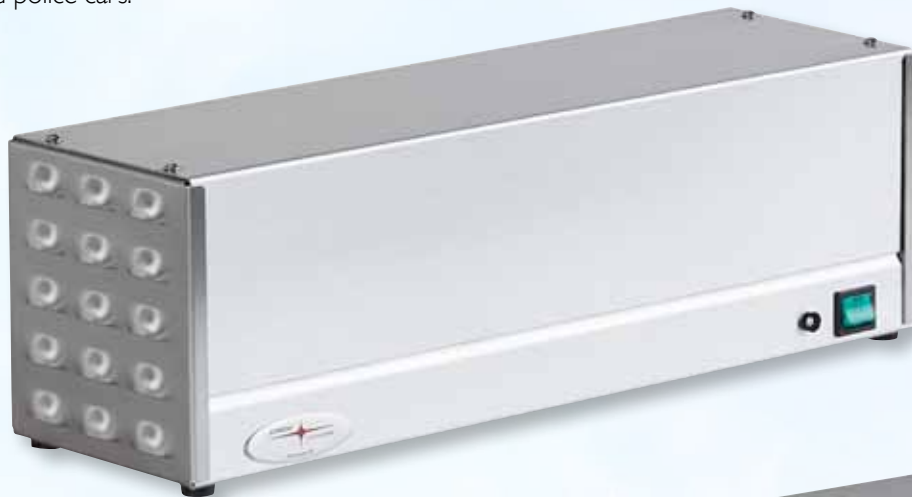
OZ1000 / OZ2000